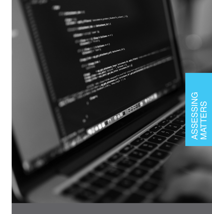
Case study: Fraud and friends

It is helpful for the Commission to be advised whether an agency is treating a s 11 matter as a PID. If the matter is a PID, responsibilities under the PID Act, such as confidentiality and keeping the discloser notified, are passed on to the Commission.