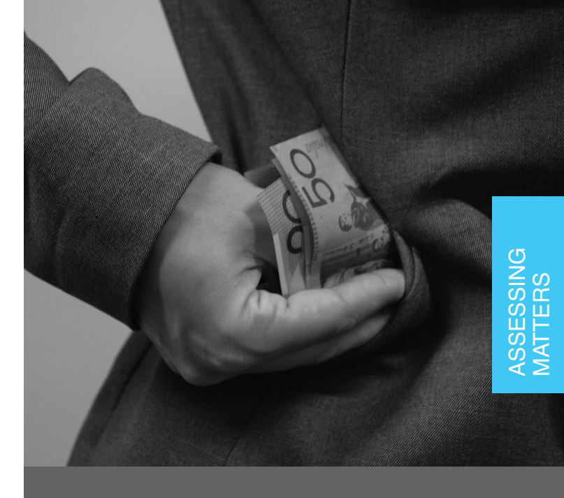
Case study: Covering the tracks

In 2015–16, there were 1,741 decisions made by the Assessment Panel to either close a matter or refer it elsewhere after closure, compared to 2,356 last year.